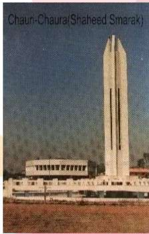
Chauri-Chaura (Shaheed Smarak)